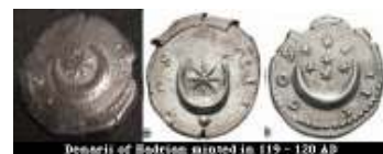
Denarii of Hadrian issued in 119 - 120 AD

Eclipses were often seen as bad luck by the superstitious ancient Romans. The Emperor Claudius was very alarmed when told that one was forecast for his birthday, and the Emperor Hadrian even had an eclipse put on his coins as if to avert any evil omen!