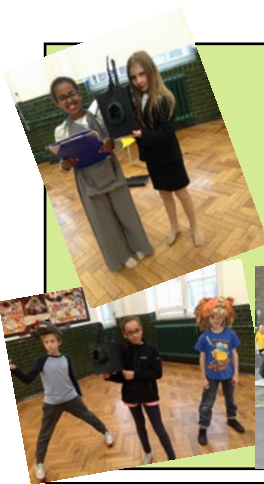
Our Shakespeare troupe perform in school for KS2 children