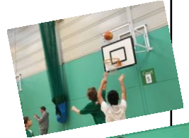
A wonderful achievement!

Our team competed against 15 teams in the CSSA one-day basketball event recently, finishing in first position after the group stages. The boys finally finished in 5th place and the girls' team were runners-up overall.