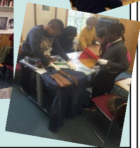
Year 6 at the Imperial War Museum