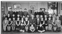
A class of 10 year olds at Primrose Hill School in 1952 and a less