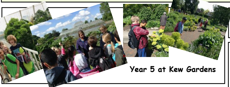
Year 5 at Kew Gardens

Children return to school after half term on Tuesday, 7th June 2016