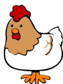
Primrose Hill Primary School CLASSES 2017-2018