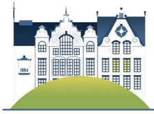
Primrose Hill Primary School