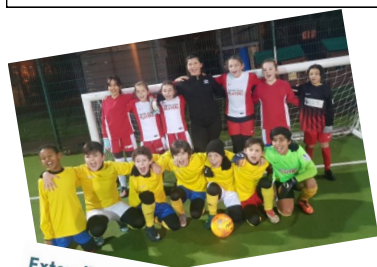
Extending Provision for Children with Autism in Primrose Hill Improvements being made at Primrose Hill Primary School