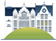
Primrose Hill Primary School