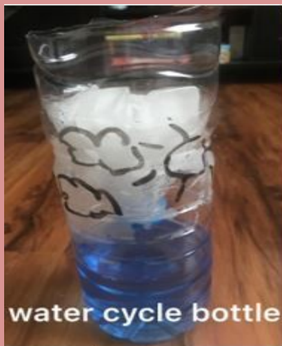
water cycle bottle

Create your own version of the Water Cycle. Watch the video to see how to make it.