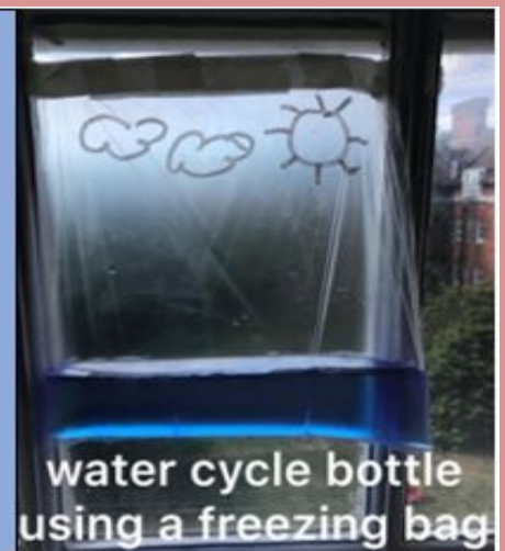
water cycle bottle using a freezing bag

End of the Day Please upload pictures and examples of your home learning directly onto the Evidence Me app or web suite for the teachers to review and celebrate. If you have any technical difficulties or need help installing and using the app, please comment on the morning register and we will get back to you with support.