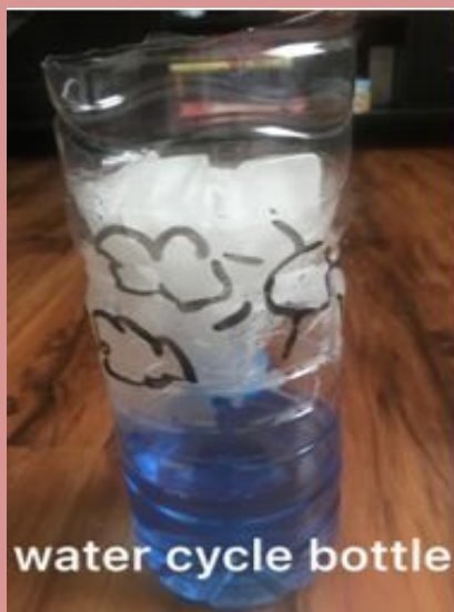
water cycle bottle

Create your own version of the Water Cycle. Watch the video to see how to make it.