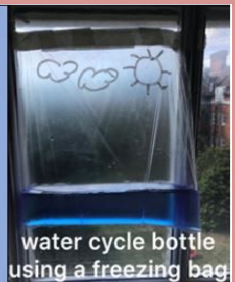
water cycle bottle using a freezing bag