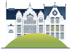
Primrose Hill Primary School