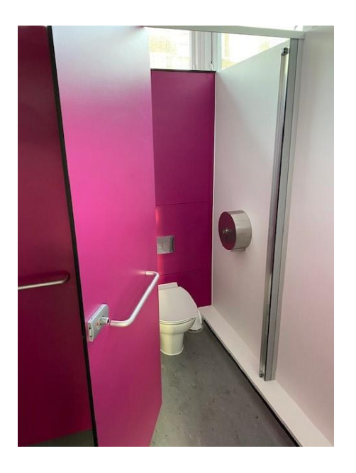
First Floor Chestnut - Additional Group Room, Washing Facilities