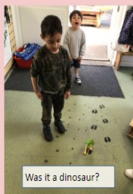
Was it a dinosaur?