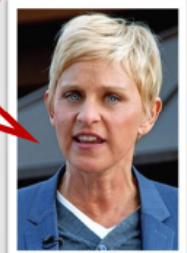
Ellen DeGeneres comedian

My grandmother started walking five miles a day when she was sixty. She's ninety-seven now, and we don't know where the heck she is.