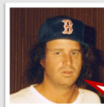
Steven Wright comedian

All truly great thoughts are conceived while walking.